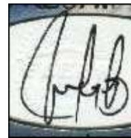
'99 Fleer Card