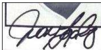
'89 Post Card