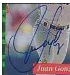
'93 Elite Dominator Card